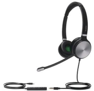
UH36 Dual Teams UH36 Dual UC