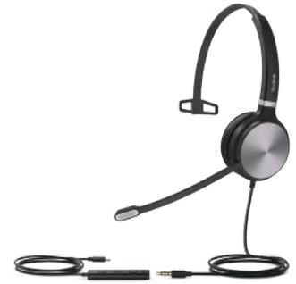
UH36 Mono Teams UH36 Mono UC

Deeply integrated with Yealink IP phones that the advanced features, such as volume synchronization and multiple calls control, are just right at your fingertips.