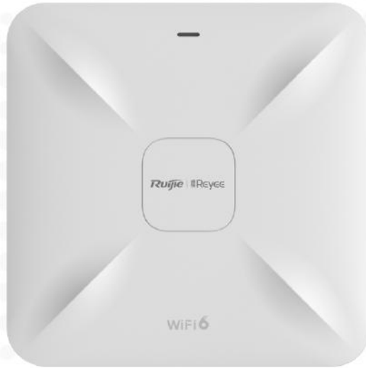
Figure 1-1 RG-RAP2260(G)