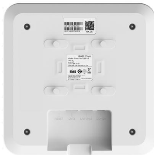
Figure 1-2 RG-RAP2260(G)