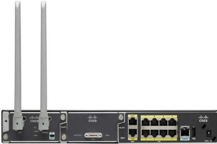
Figure 3. Cisco 800M ISR (C841M-4X) with WIM-3G and WIM-1T