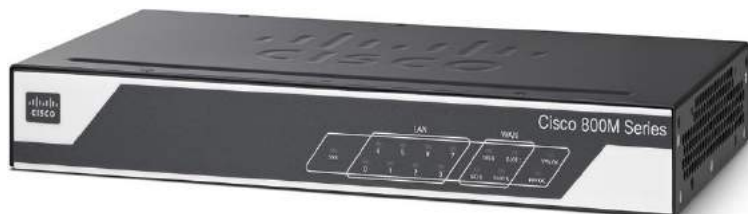
Figure 1. Cisco 800M ISR (C841M-8X)

The Cisco 800M Series platform supports pluggable Cisco WAN Interface Modules (WIMs) for flexible connectivity.